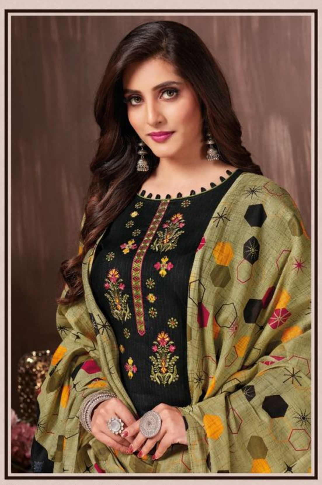
Rise up to the pinnacle of fashion and glorify the world.