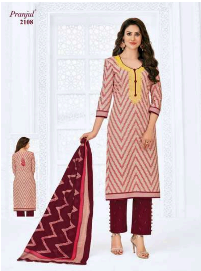
Pranjul ® 2108