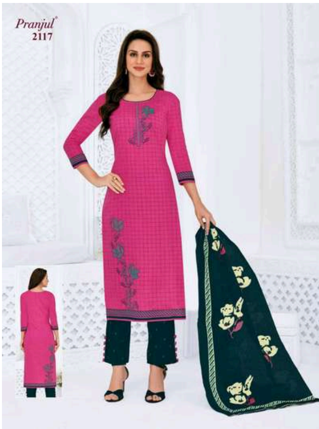
Pranjul ® 2117