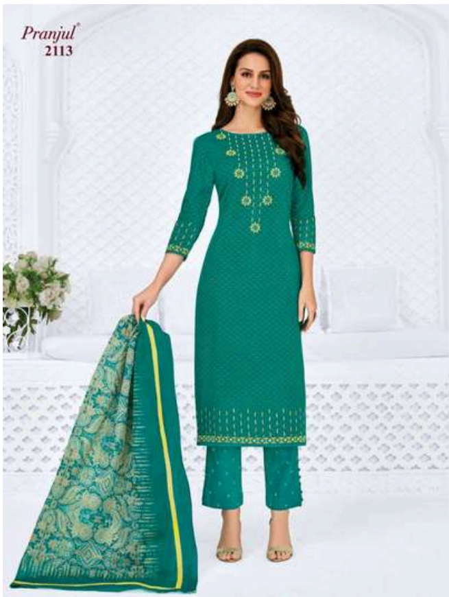
Pranjul ® 2113