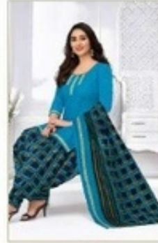
967 Premium Collection