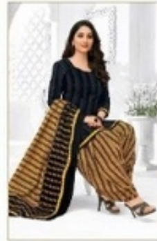
957 Premium Collection