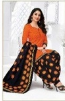
956 Premium Collection