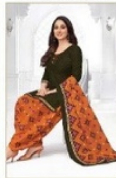
962 Premium Collection