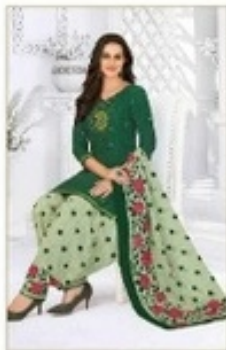
969 Premium Collection

Pranjul ® Priyanka ® Vol. 9 (Patiyala Special)