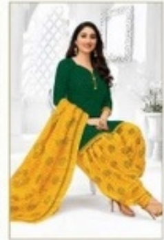
958 Premium Collection