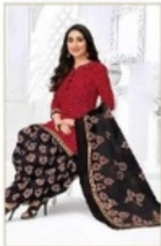
959 Premium Collection