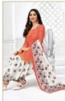
961 Premium Collection