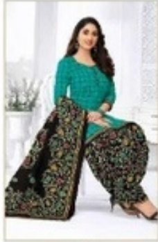
964 Premium Collection