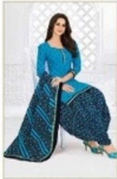
954 Premium Collection