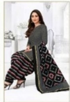
963 Premium Collection