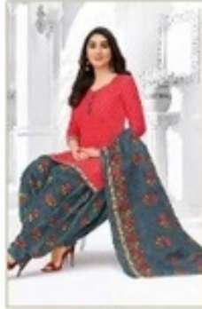
965 Premium Collection