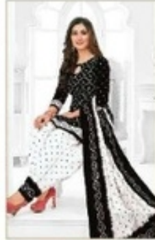
966 Premium Collection