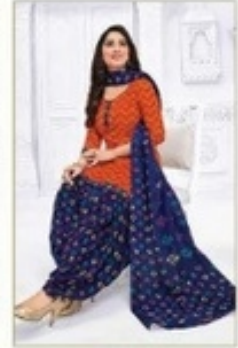
968 Premium Collection