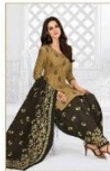
970 Premium Collection

Pranjul ® Priyanka ® Vol. 9 (Patiyala Special)