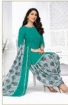
955 Premium Collection