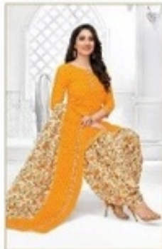
960 Premium Collection