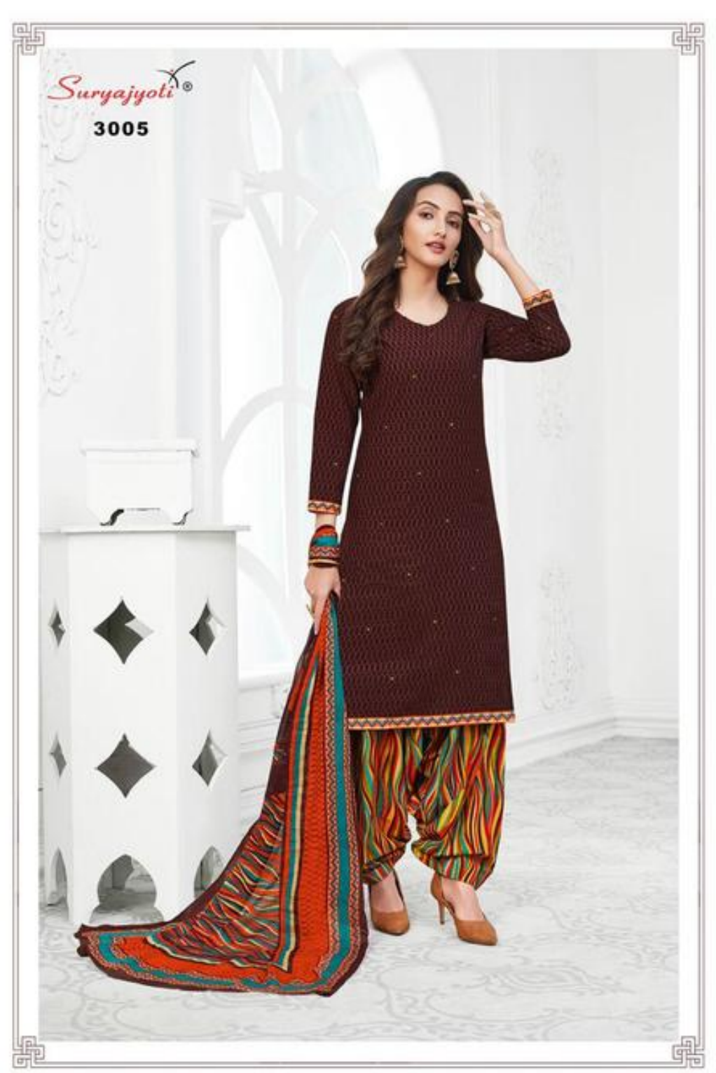
Good and classy - add sparking touches to your looks.