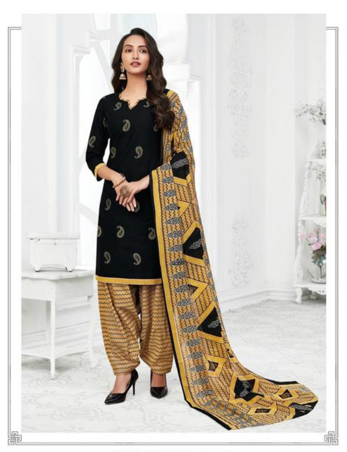
Elegance & sophistication create a charming symphony