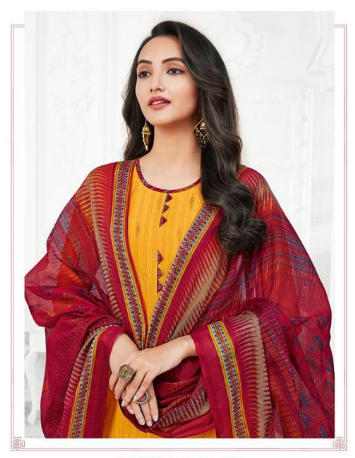
Elegance & sophistication create a charming symphony