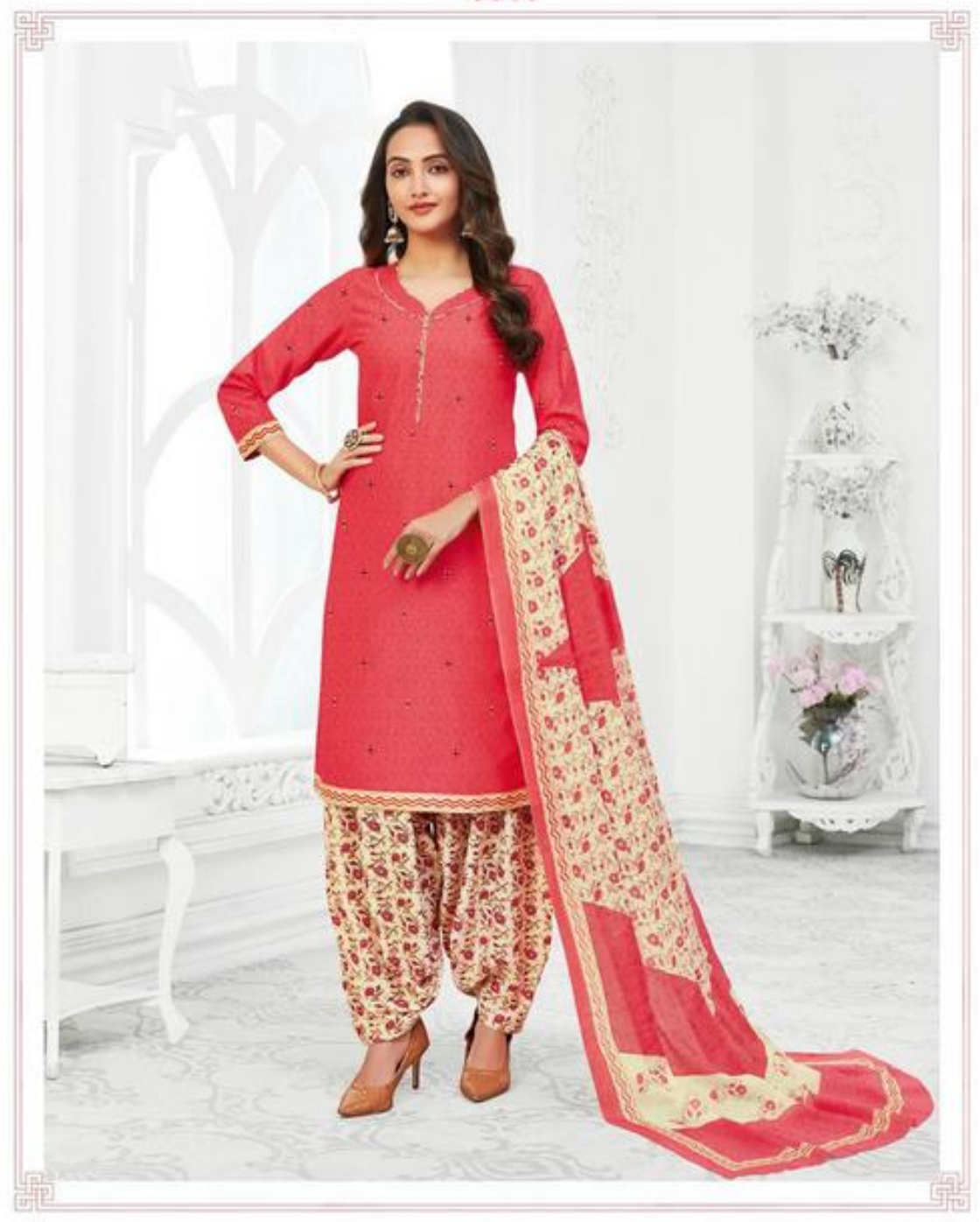
Dictate your style statement with the season's latest trends