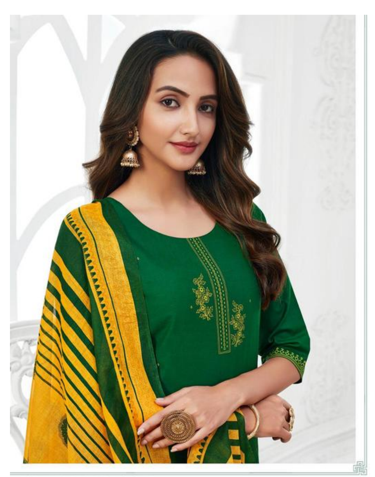
Stock up on new fun prints that will take your breath away