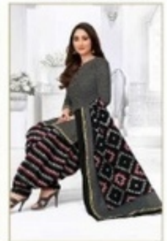
963 Premium Collection