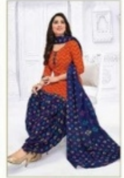
968 Premium Collection