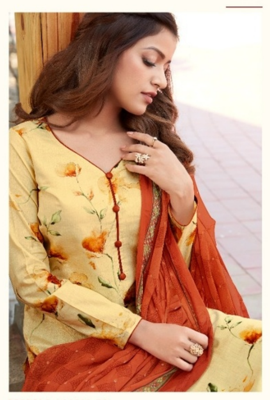
BESPOKE ACCESS TO LEADING styles