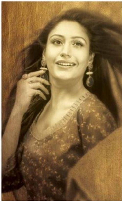
MISS INDIA MAHARANI

Our Specialities also in Kurtis, Salwar Suits, Fabrics & Readymade