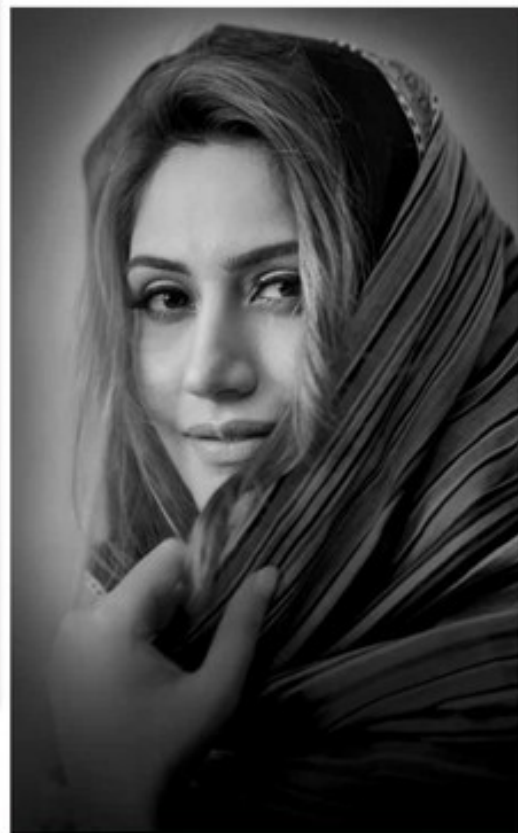
CHIEF GUEST SPECIAL CHUNDRI PICHKARI