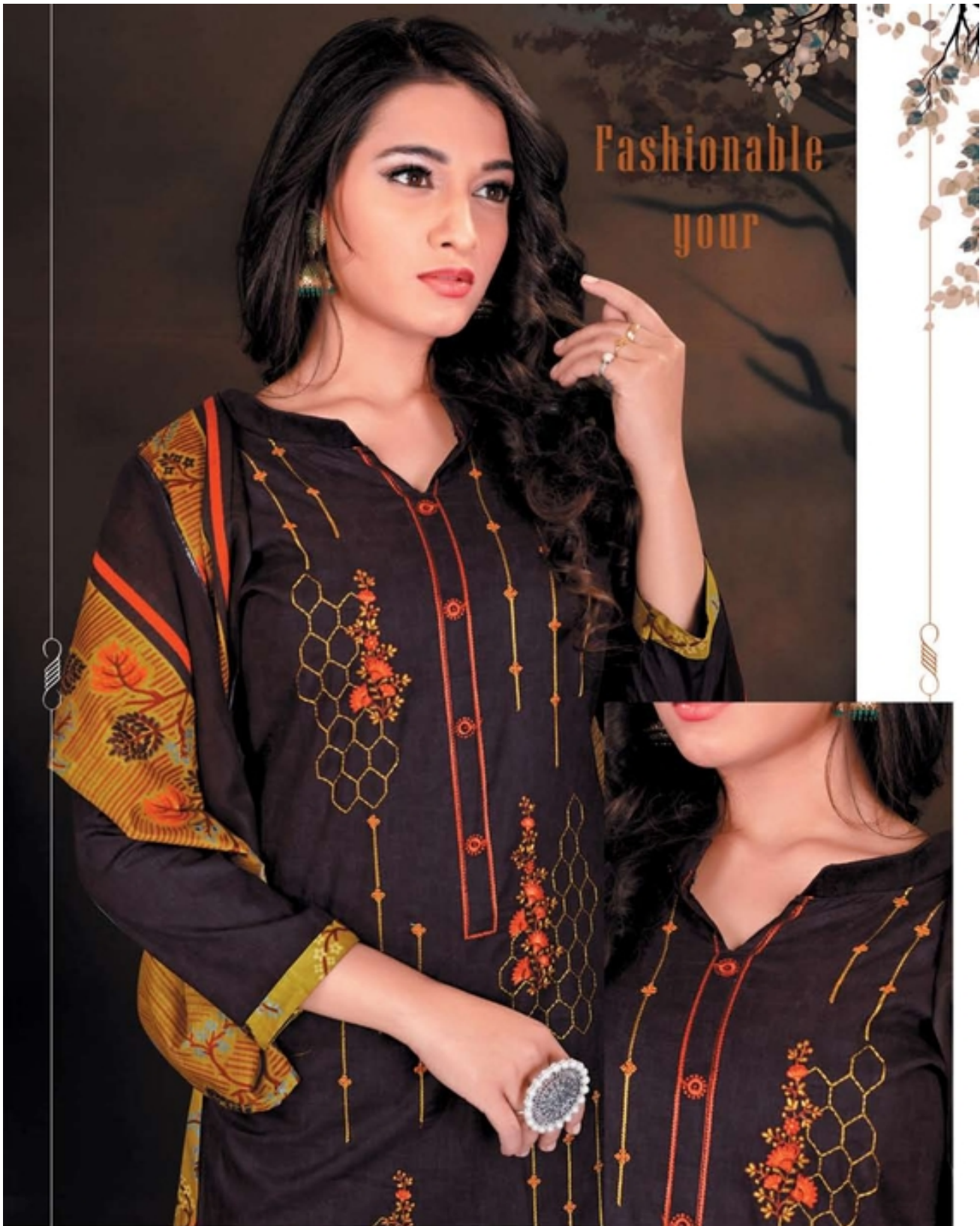
She considers herself fashionable and see luxury brands as necessary components of updating her lifestyle.