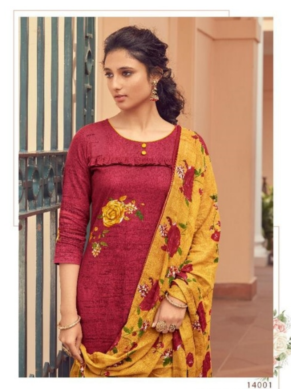
A PERFECT MOVENT TO EMBRACE THE STYLE YOU HAVE!