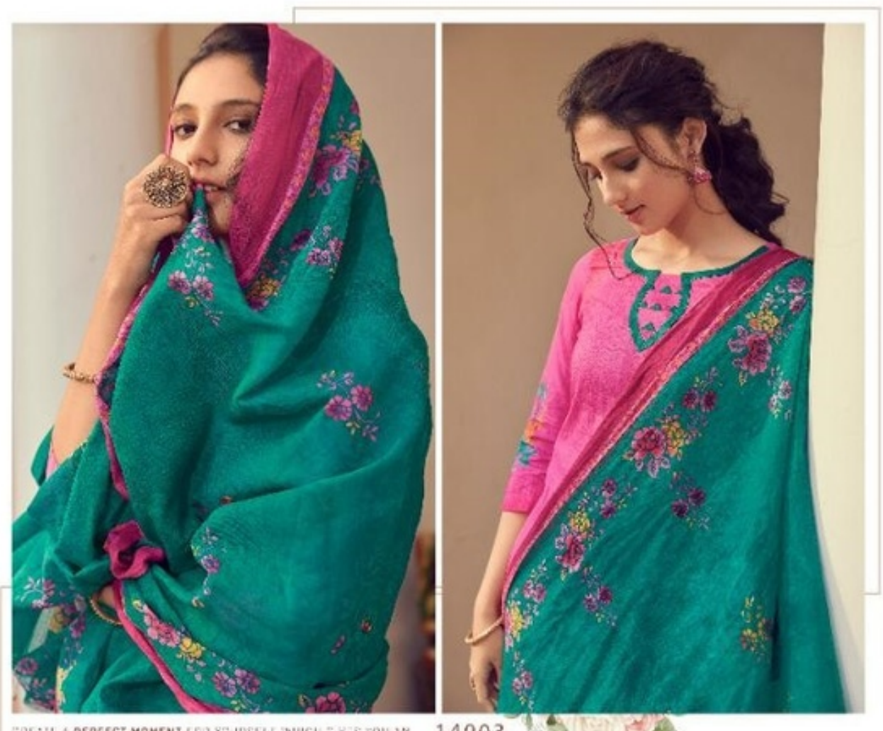
CREATE A PERFECT MOMENT FOR YOURSELF WHICH S YES YOU AN APPLAUSE YOU'RE YOU'R PERSONA.