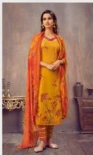
d.no : 9003