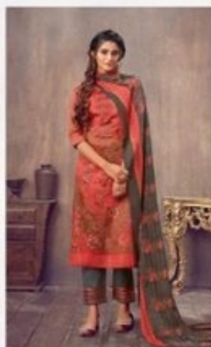
d.no : 9010