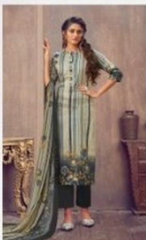
d.no : 9006