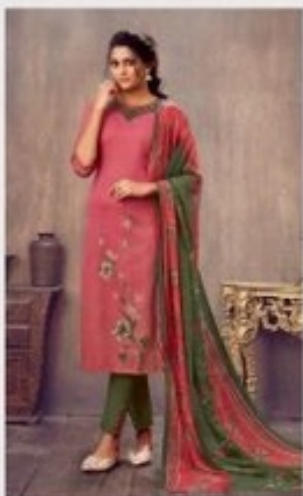
d.no : 9002