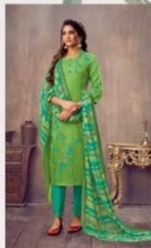
d.no : 9004