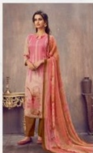
d.no : 9007