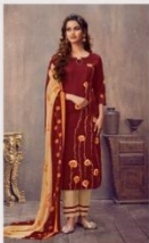
d.no : 9001