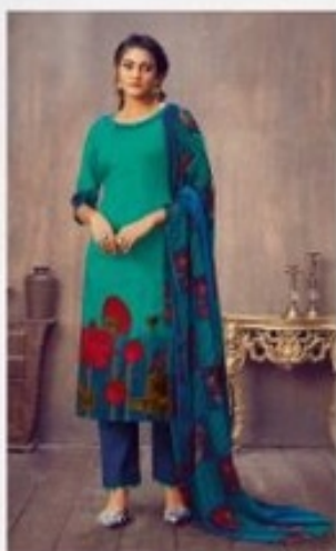
d.no : 9008