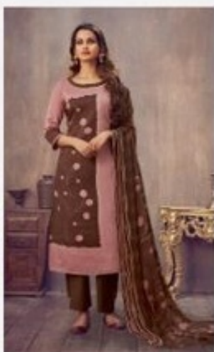
d.no : 9009