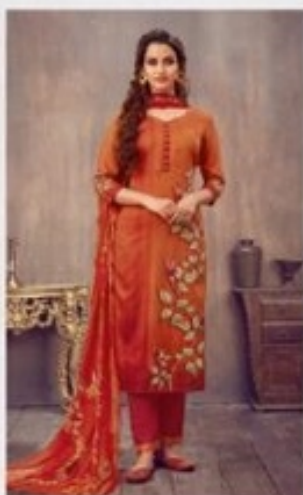
d.no : 9005