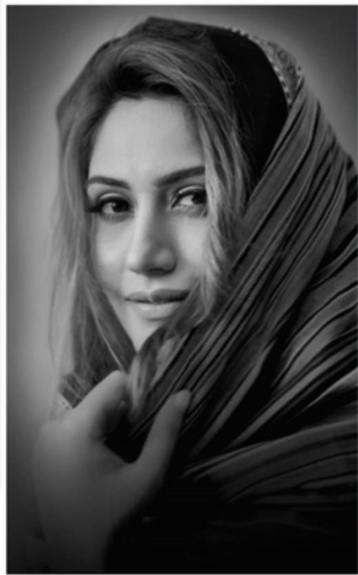
CHIEF GUEST SPECIAL CHUNDRI PICHKARI