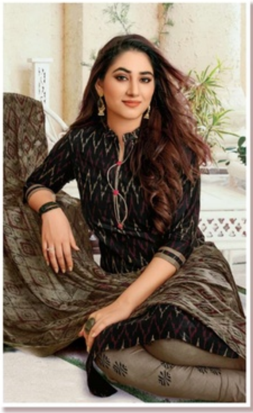
MISS INDIA MAHARANI

Our Specialities also in Kurtis, Salwar Suits, Fabrics & Readymade