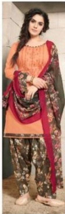
D // 4008