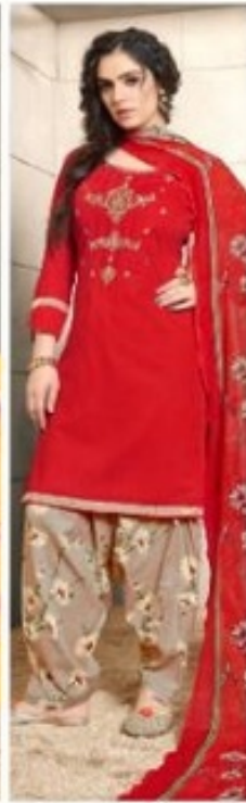
D // 4004