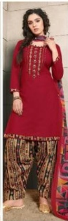
D // 4010