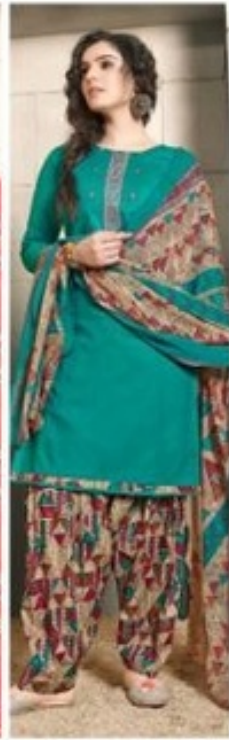
D // 4005