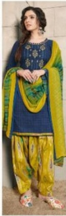
D // 4002