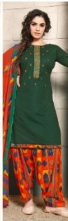
D // 4009