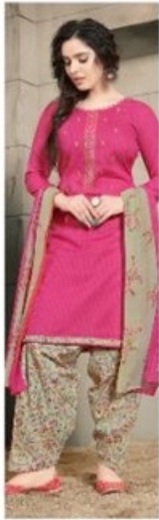
D // 4001