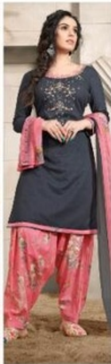
D // 4007