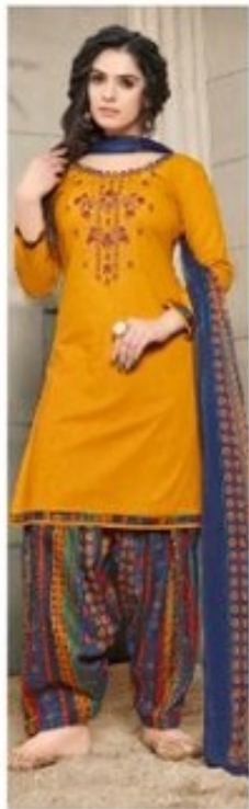
D // 4006