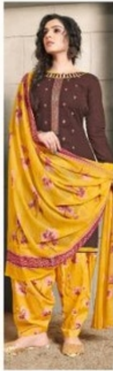
D // 4003