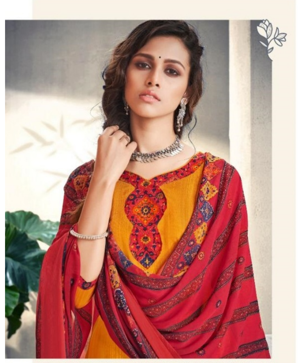
The new minimalist Show stealing red never goes out of style as the colour of love and mischief it remains the quintessential shade of feminity".