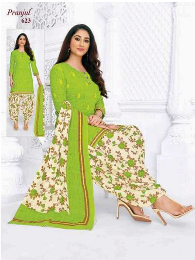
Pranjul ® 623