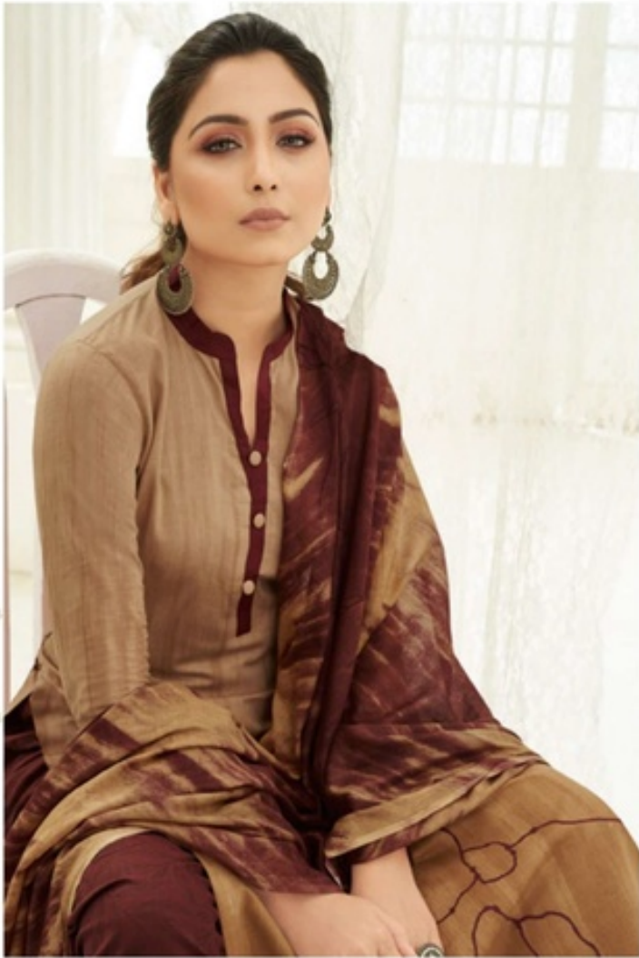
4809 COLLECTION | 2020