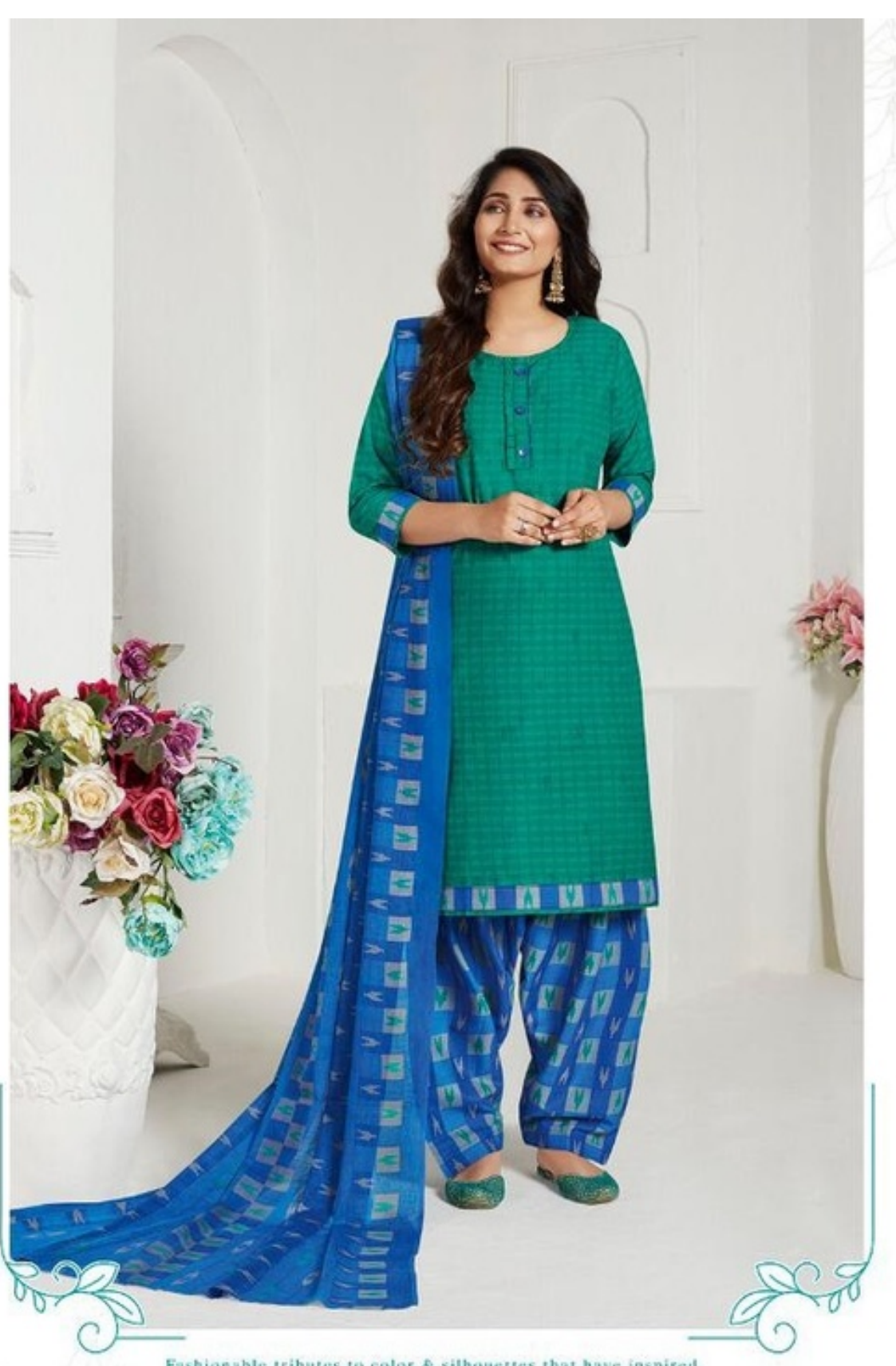
Fashionable tributes to color & silhouettes that have inspired trends around the world.