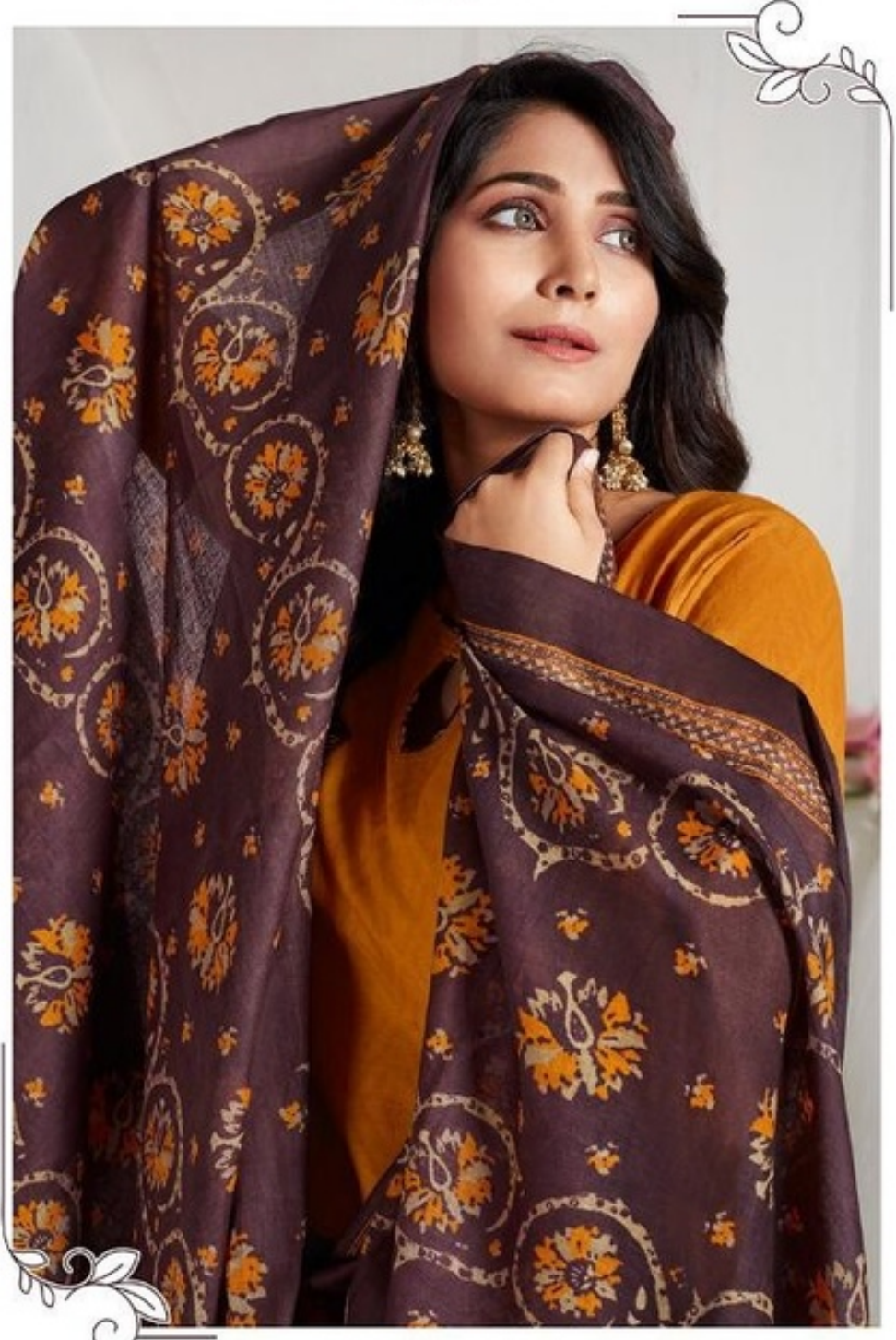
The collection was a perfect blend of Indian silhouettes & contemporary style.