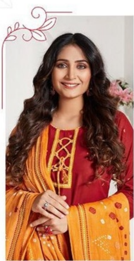
The Blast of bright colors-one of this season's most favorite fashion trends