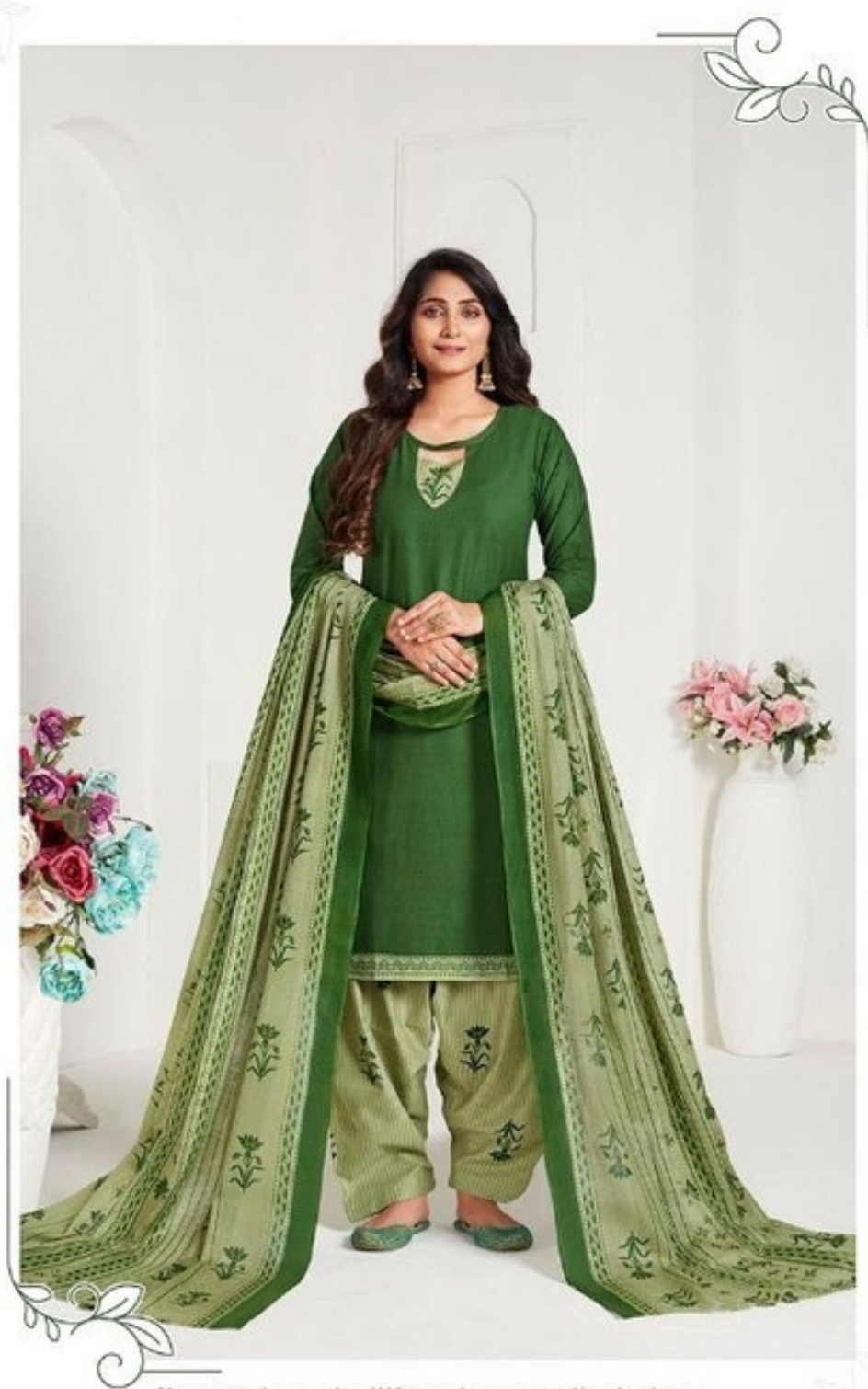
You must dare to be different because styling is always to be exclusive.