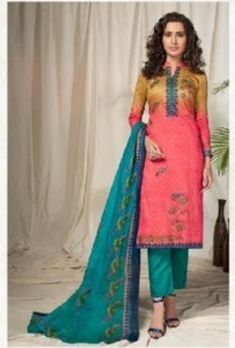
5 0 0 2