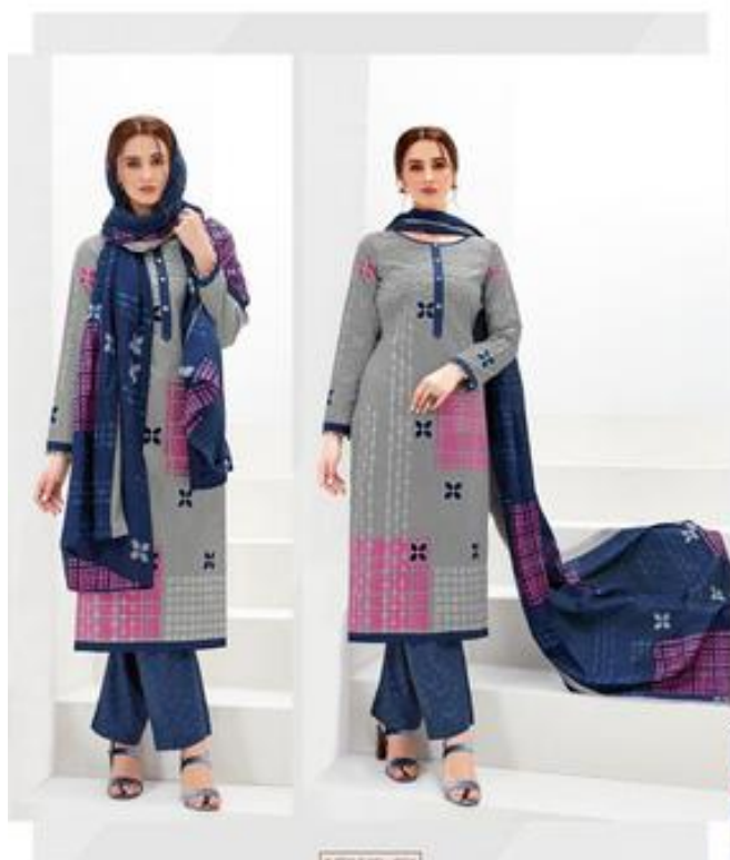
• STYLE NO. - 804