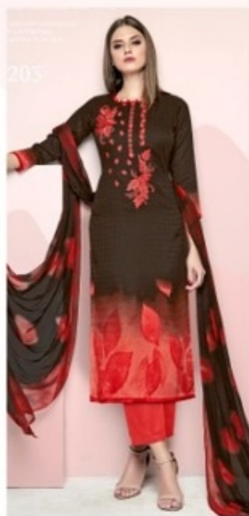
DESIGN : 205