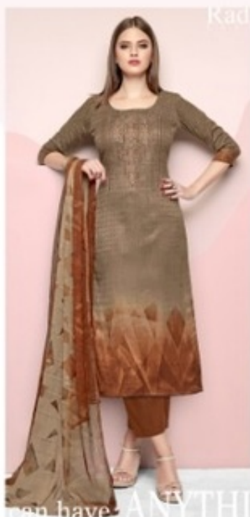
DESIGN : 202