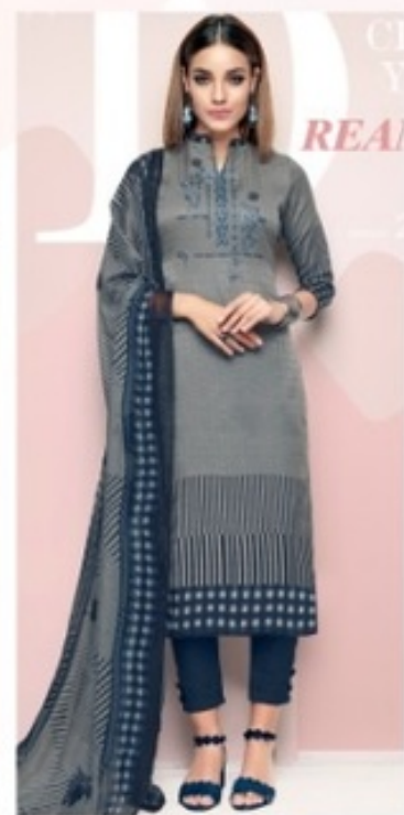
DESIGN : 206