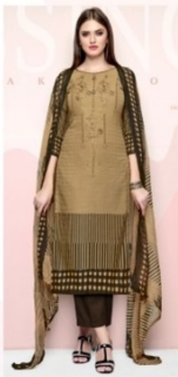
DESIGN : 205