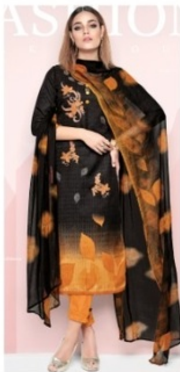
DESIGN : 204