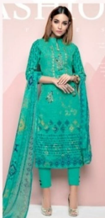
DESIGN : 210