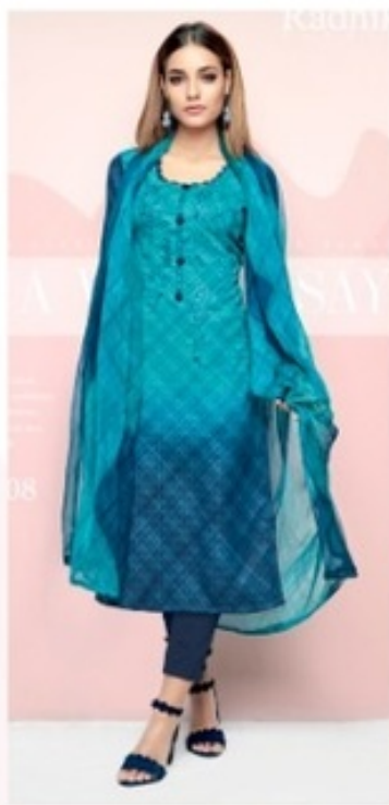
DESIGN : 203