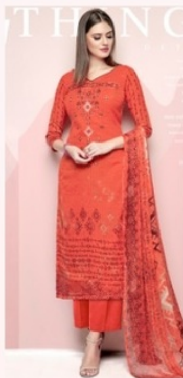
DESIGN : 209