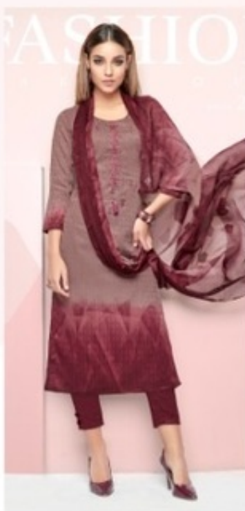
DESIGN : 209