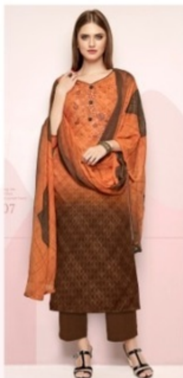
DESIGN : 208