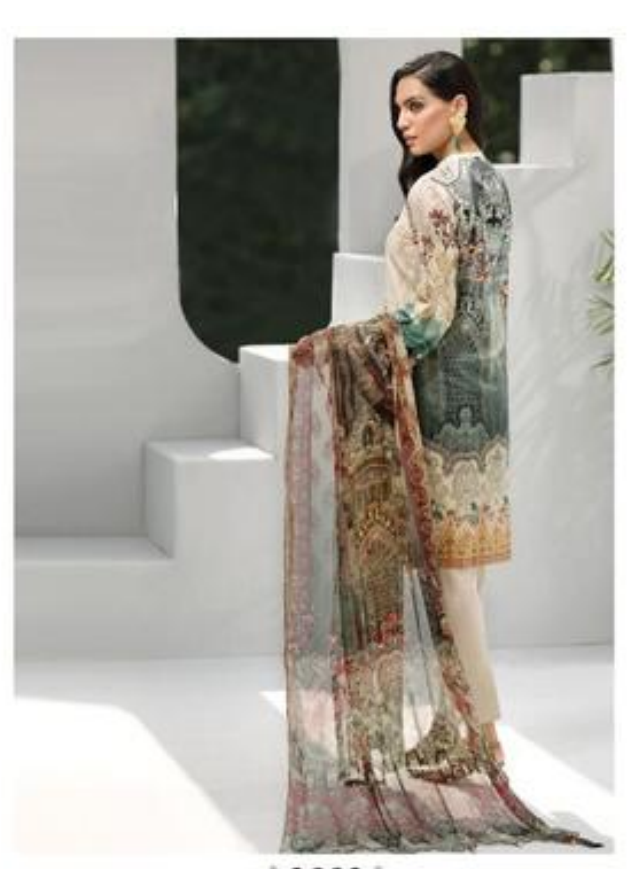
€ 2003 ⊕ AMELIA