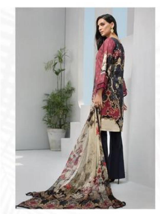
♣ 2001 ♣ TURKISH TALE