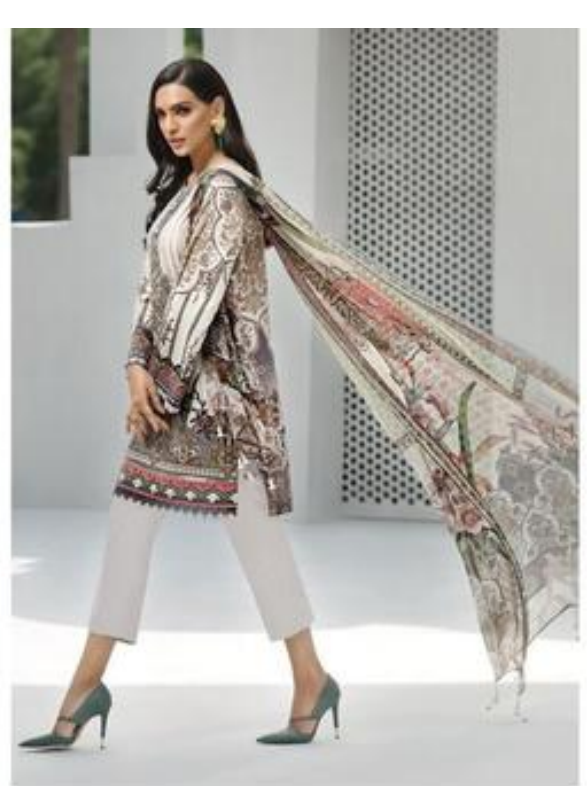
$2002 ♣ GYPSY FLEUR