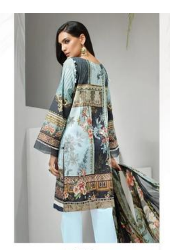
♣ 2004 ♣ AQUA AZURE