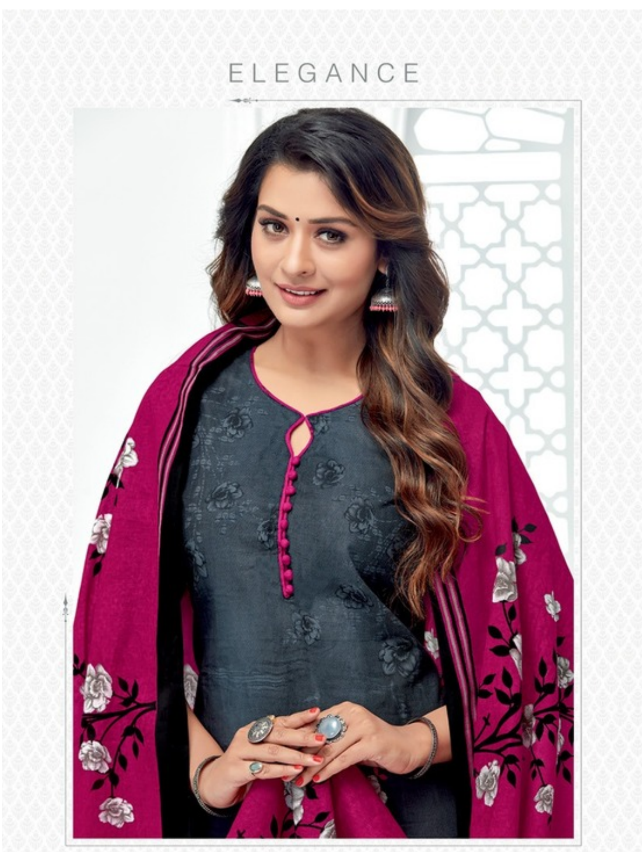
Beauty , unaccompanied by virtue, is as a flower without perfume.