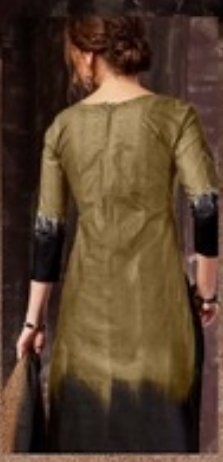
Siya Vol.02 D.No. 206