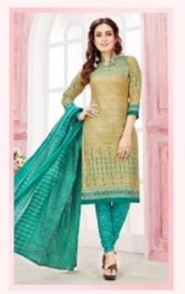
D No 4012