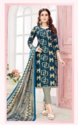
D No. 4011