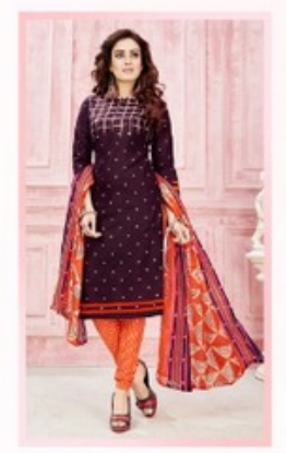
D No. 4009