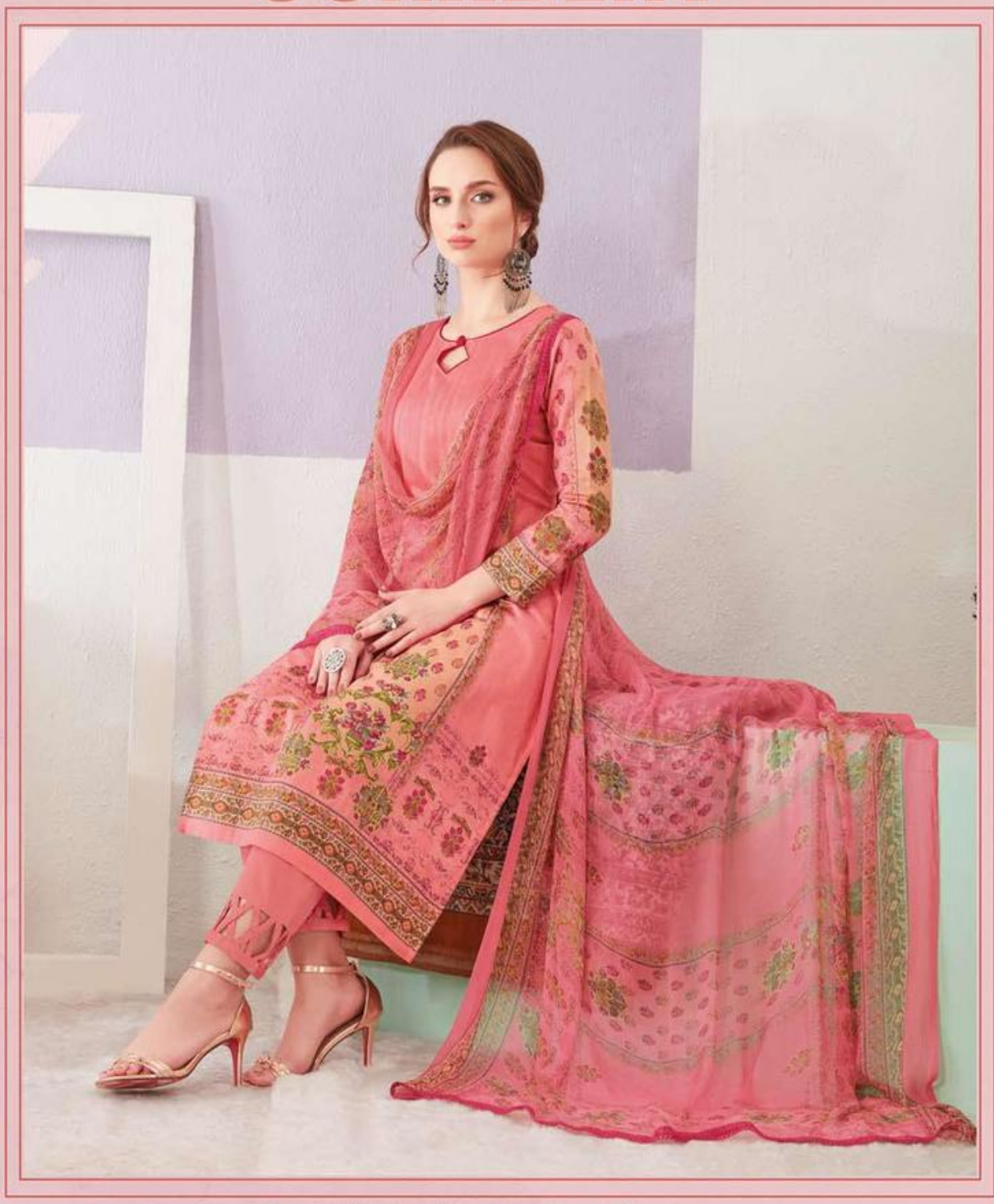
Smart & stylish , this suit is sure to make you look gorgeous.