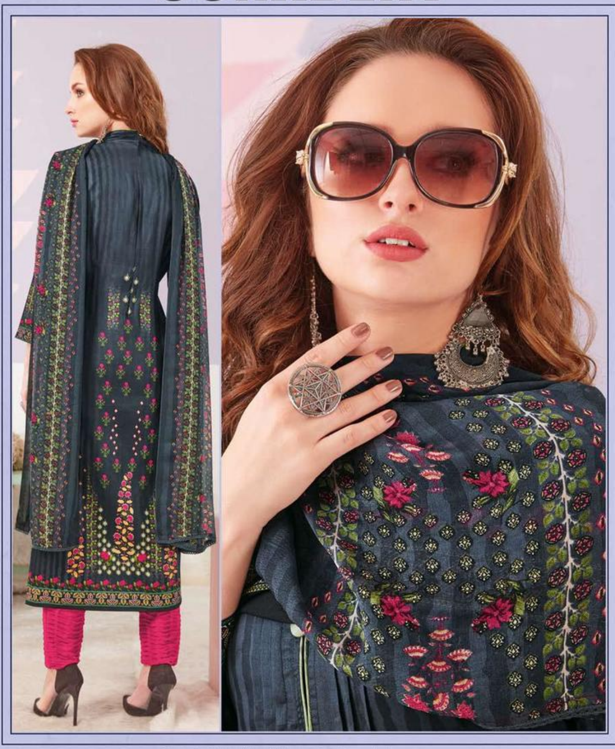
Smart & stylish , this suit is sure to make you look gorgeous.