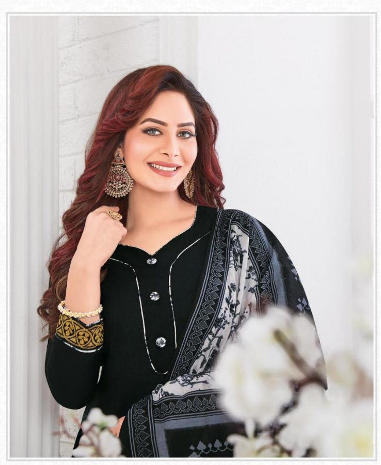
A NEW DESIGNER COLLECTION

THE PASHKIN ABLE AND DESIGNER DRESS. MAGICAL BEAUTIFET, AND ATTRACTIVE USEGN AND HIE FORHON MAKE THE WOMEN. MAGICAL BEAUTIFET, AND ATTRACTIVE OF SIGN AND HE FORHON MAKE THE WOMEN.