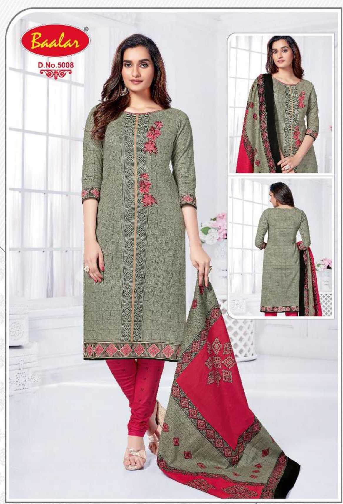
Fashion is not necessary about labels its not about brands its about something else that comes from within, be yourself coz everyone else is already taken....