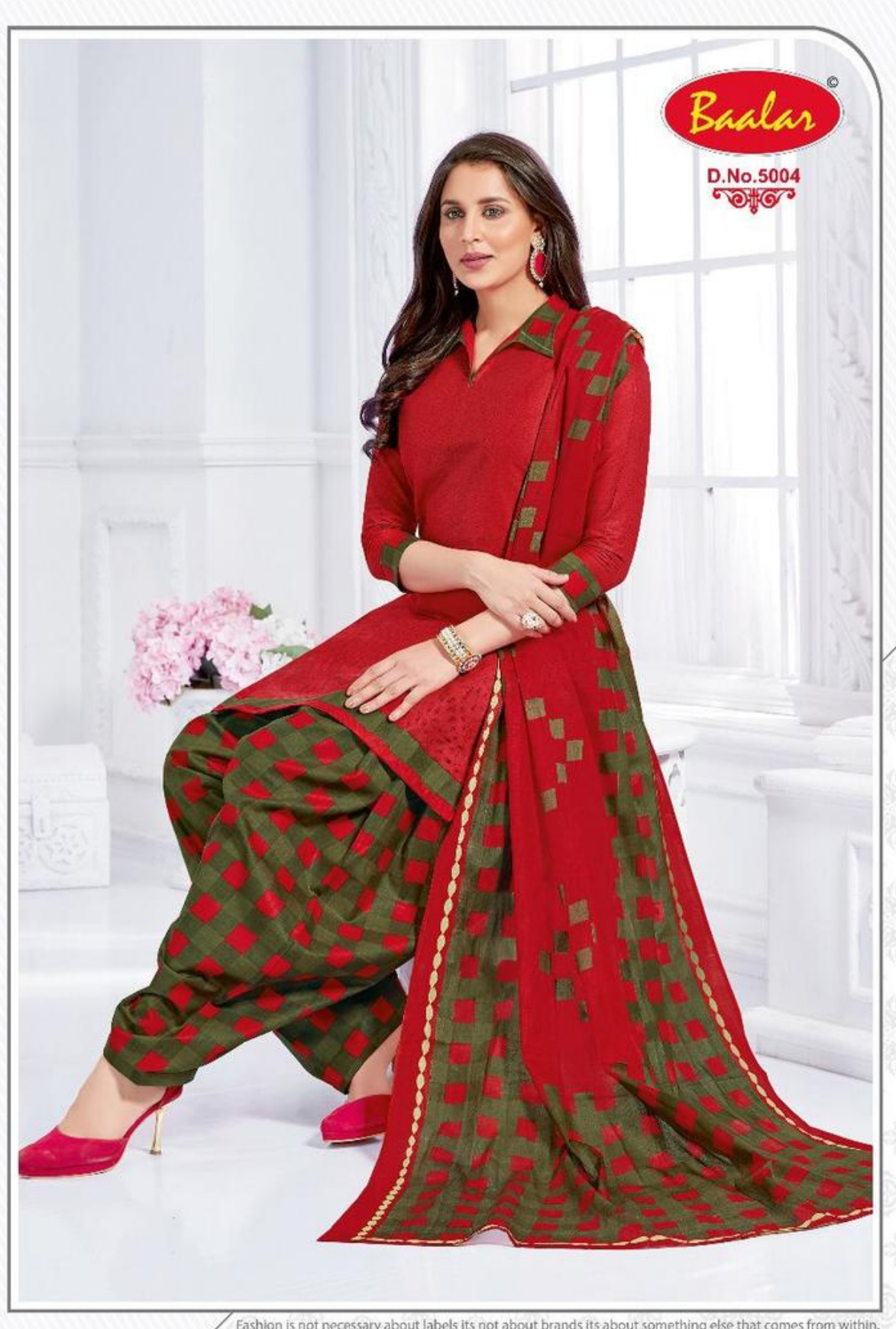
Fashion is not necessary about labels its not about brands its about something else that comes from within, be yourself coz everyone else is already taken....