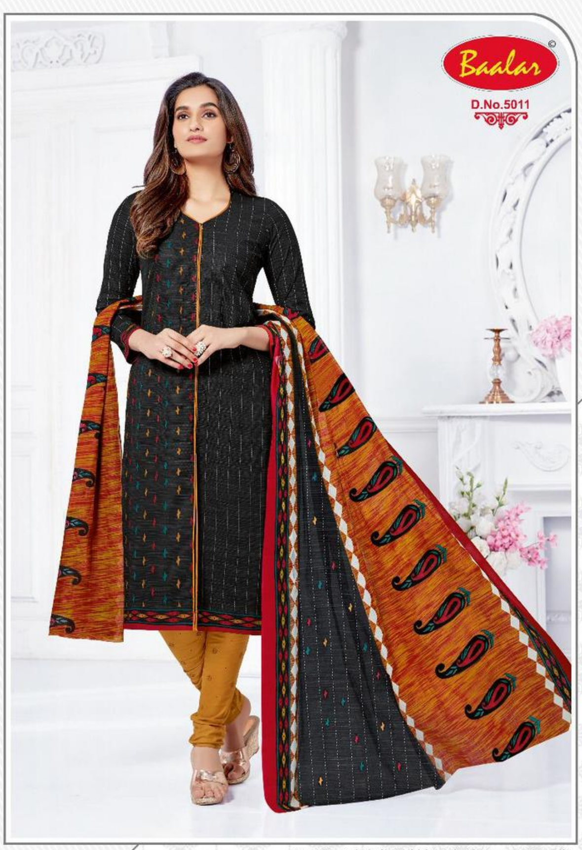
Next time you think of beautiful things, dont forget to count yourself in., Beauty is not in the face, Beauty is a light in the heart.