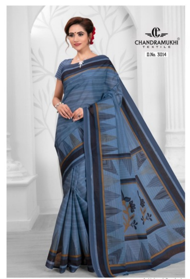
l Product A Natural Product