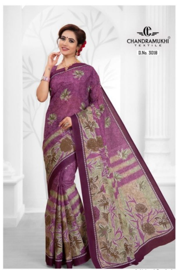
A Natural Product