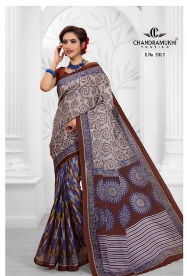
A Natural Product